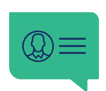
PROFESSIONAL & PERSONAL DEVELOPMENT OF INCLUSIVE PRACTICE

Design and implement a communication system for all members of the Yale School of Music community to share positive and constructive feedback with administration